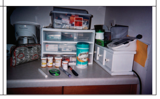
FIGURE 3: Example photos and quotations within mental and physical health interconnections theme

"[This is] just showing, the process you have to go through and because of my diabetes and [the] condition I'm in all the different depression and anxiety [medications] I'm on now and if I would have taken care of myself and taken my medication and exercised, I would be healthy and I wouldn't need ¾ of these medications."